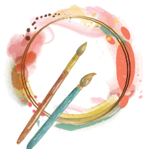
Therapeutic & Creative Arts